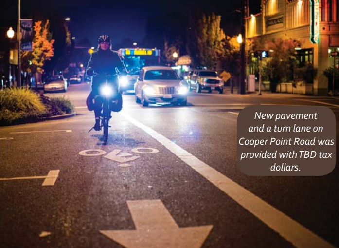
New pavement and a turn lane on Cooper Point Road was provided with TBD tax dollars.

With the establishment of a TBD, the City can begin to replace the transportation funding that has been lost over the years, reduce or eliminate the General Fund subsidy, and be better able to preserve, maintain or expand the City's transportation infrastructure into the future.