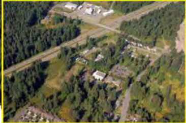
Kaiser - Existing

Add westbound off-ramp and Eastbound on-ramp to US 101 from Kaiser Road.