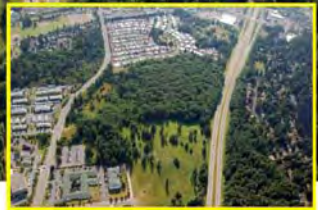
Yauger Way Vicinity - Existing

Construct westbound off-ramp from Black Lake Interchange to connect to Yauger Way.