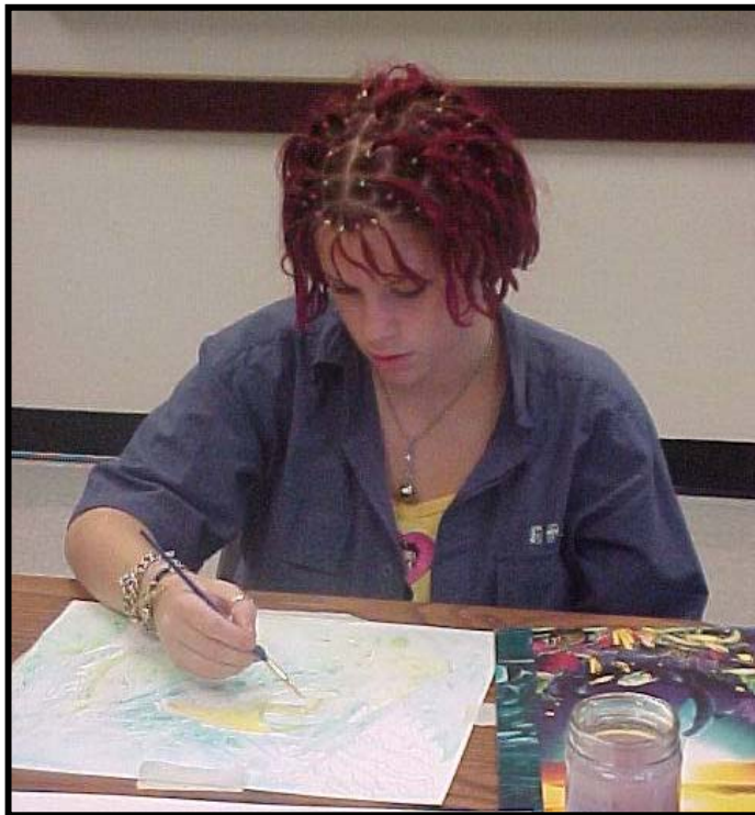
Watercolor for Youth Participant

The survey results are summarized as follows: