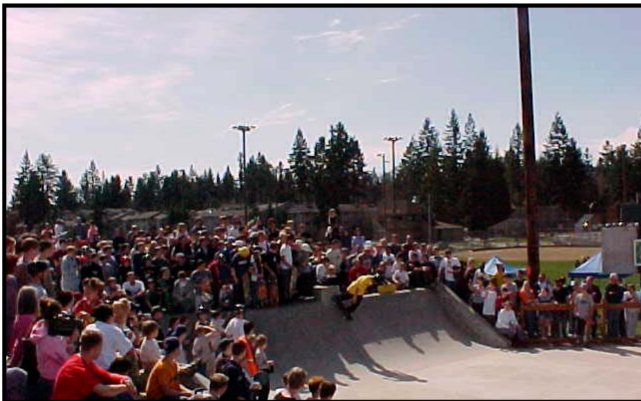
Olympia Skate Court Dedication - April 11, 2000

Most respondents believe that neighborhood needs should be met through a combination of neighborhood parks and nearby open space areas.