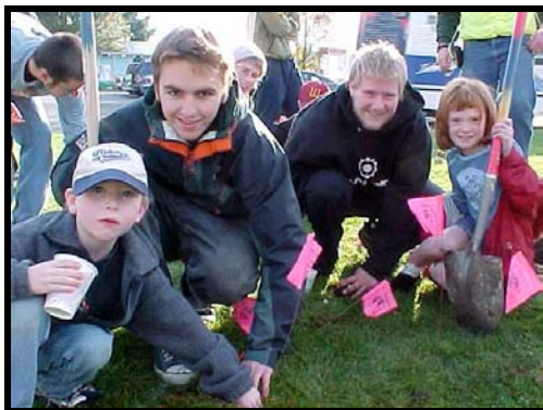
Volunteers In Parks