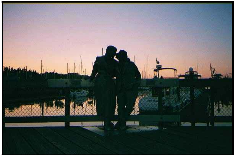
"The Kiss" by Richard Beyer

The Plan Steering Committee met eight times during the planning process. Much of their work focused on grappling with specific planning issues, reviewing possible actions, and developing recommendations. The recommendations of the Plan Steering Committee are summarized below.