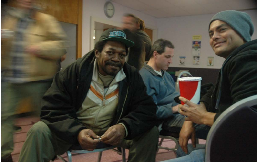
Proposed Community Care Clinic would offer services for homeless and other street dependent people (Photo: Interfaith Works Warming Center, which served as one of the models for the Community Care Clinic)