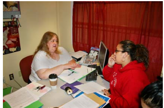
The Family Support Center provides homeless prevention and other family services, funded by CDBG.

Accomplishments: 1,604 people received public or social services, of which 1,174 were adults, 243 were children, and 187 were youth. Included in these services were 11,210 shelter bed nights in local shelters. Some of the public services reported fewer people served than proposed in the annual action plan. This was the result of these subrecipients conducting a shorter contract period that involved less people than a full fiscal year as originally proposed.