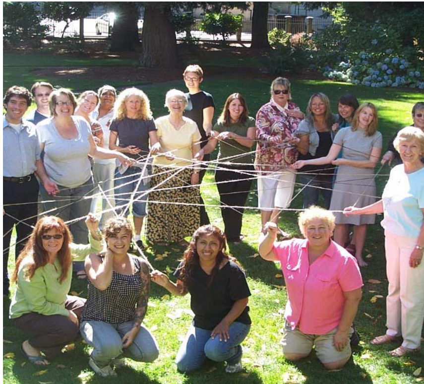
Staff of SafePlace Domestic Violence Shelter, which received funds for services and developing a Community Center

First Year of a Three Year Consolidated Plan Fiscal Year September 1, 2010 - August 31, 2011 (PY 2010)