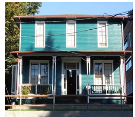
Steele House Apartments were built in 1869 and needed a lead-safe certified contractor to repaint the exterior, funded by CDBG. Funded by PY 2009 funds, completed in PY 2010

The City of Olympia continues to work with our single-family and multifamily loan program to reduce lead-based paint. The education and outreach component provides educational literature to homeowners rehabilitating their own homes, lead workers, and community residents, while working with other efforts to address lead poisoning issues in the community. The City is implementing our Lead-Based Paint Implementation Plan in coordination with the local Housing Authority. This effort includes referrals to lead paint certification classes to assist construction contractors to become certified to work on government-funded housing projects.