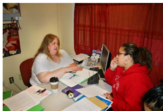
The Family Support Center provides homeless prevention and other family services, funded by CDBG.

Accomplishments: 1,384 people received public or social services, of which 653 were adults, 554 were children, and 177 were youth. Included in these services were 8,523 shelter bed nights in local shelters. Some of the public services reported fewer people served than proposed in the annual action plan. This was the result of these subrecipients conducting a shorter contract period that involved less people than a full fiscal year as originally proposed.