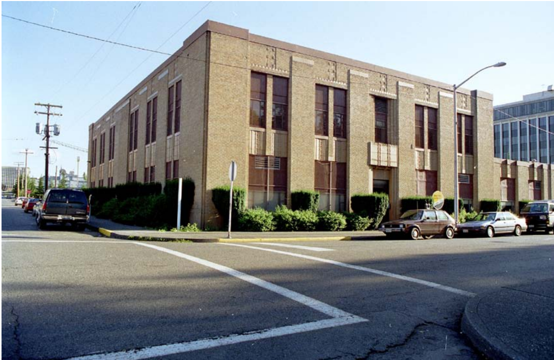
The historic Fleetwood Building exterior was waterproofed with CDBG funds, keeping 43 formerly homeless households warm and dry.

Fifth Year of Five-Year Consolidated Plan Fiscal Year September 1, 2009 - August 31, 2010 (B-2009)