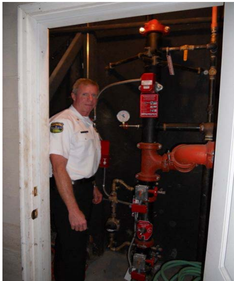
Olympia's Fire Marshal examines the new CDBG-funded fire sprinkler system at the Angelus Hotel Apartments that keeps 29 low-income households safe.

Housing Rehabilitation: Support affordable housing through housing rehabilitation programs that make essential repairs to ensure safe, decent, and sanitary housing stock is available to low- and moderate-income people. This includes programs for both owner-occupied and tenant-occupied housing.