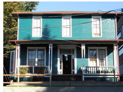
Steele House Apartments were built in 1869 and needed a lead-safe certified contractor to repaint the exterior, funded by CDBG.

The City of Olympia continues to work with our single-family and multifamily loan program to reduce lead-based paint. The education and outreach component provides educational literature to homeowners rehabilitating their own homes, lead workers, and community residents, while working with other efforts to address lead poisoning issues in the community. The City is implementing our Lead-Based Paint Implementation Plan in coordination with the local Housing Authority. This effort includes referrals to lead paint certification classes to assist construction contractors to become certified to work on government-funded housing projects. They also distribute lead paint hazard information and referrals to other local and state-funded testing and lead hazard remediation services.